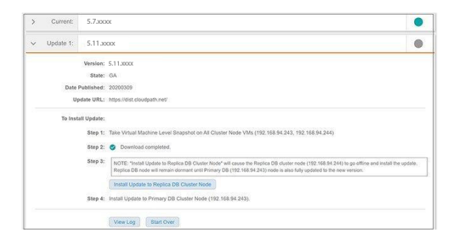
FIGURE 2 Download Completed for Update