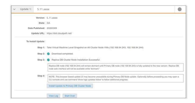
FIGURE 3 Replica DB Installation Successful

6. Continue by clicking Install Update to Primary DB Cluster Node.